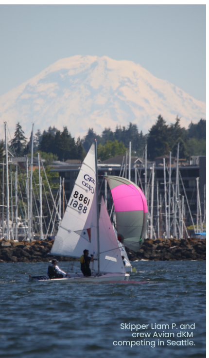
Skipper Liam P. and crew Avian dKM competing in Seattle.