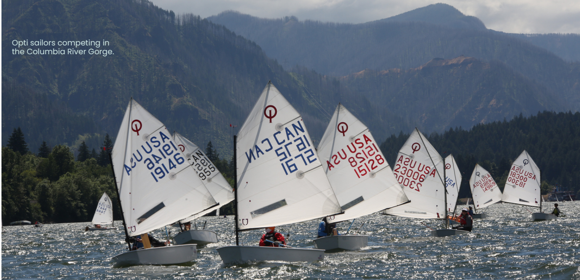
Opti sailors competing in the Columbia River Gorge.