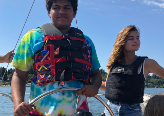
Sailors during the Thurston County Inclusion event.