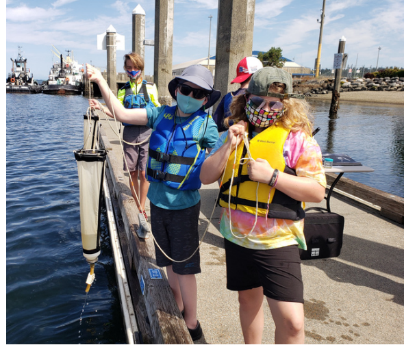
STEAM sailors collecting microorganisms off of Port Plaza dock in downtown Olympia with PacShell.

With partners from the Pacific Shellfish Institute and Olympia's local Estuarium, sailors had the chance to participate in citizen science programs. Sailors learned about Harmful Algal Blooms (HABs) and assisted scientists in identifying and counting microorganisms in samples they collected from Budd Inlet. Our sailors contributed to eleven weeks of data that NOAA used to track water quality and trigger shellfish harvesting closures in South Sound when HABs could lead to shellfish poisoning.