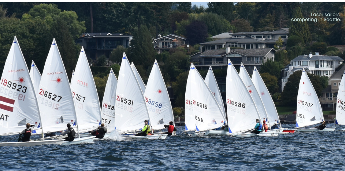
Laser sailors competing in Seattle.