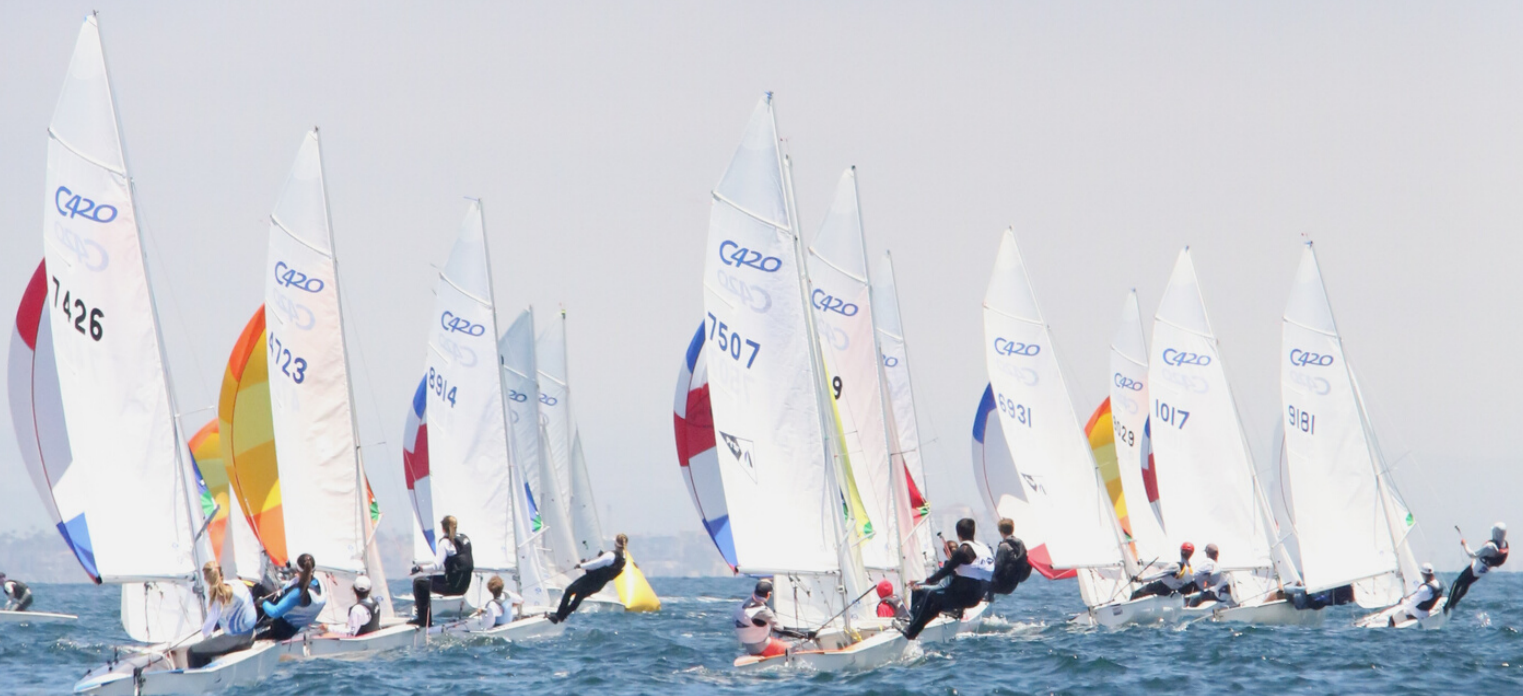
Photo: c420 sailors at c420 Nationals

The Advance, South Puget Sound Community College [May 6, 2022]