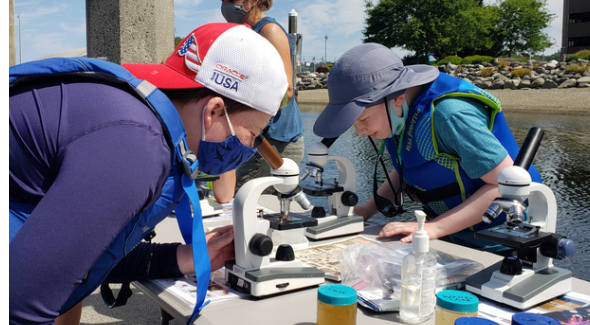
STEAM sailors using microscopes to identify algae species and other microorganisms.